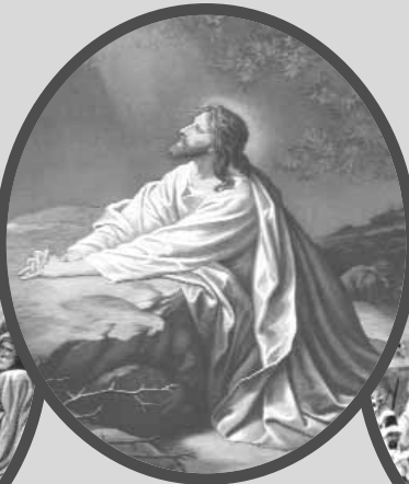
JESUS AT GETHSEMANE