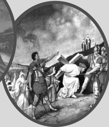
JESUS BEARING THE CROSS