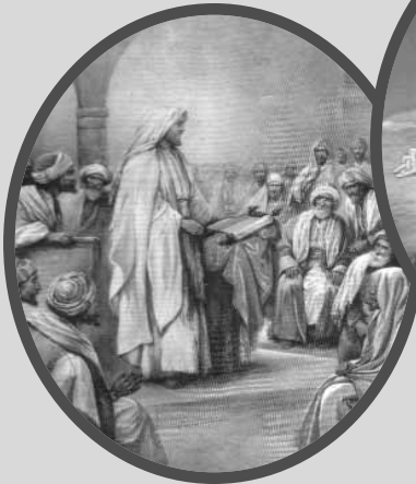
JESUS BEFORE CHIEF PRIESTS