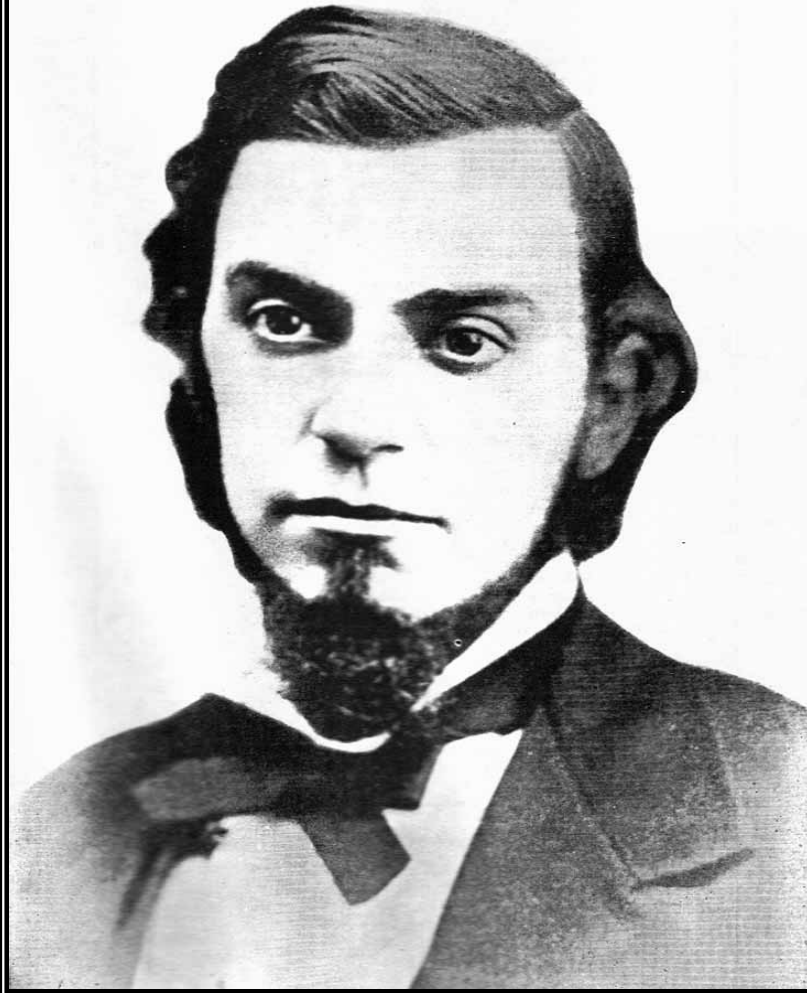
BRO. RUSSELL RECOMMENDED TO DR. SEISS

accepted the fact that the Bible teaches the pre-Millennial advent and Millennial reign of our Lord. In fact, it was Dr. Seiss' book on The Last Times , which advocated the pre-Millennial advent and Millennial reign of Christ that convinced the writer of the truth of these two doctrines and began to shake the writer's